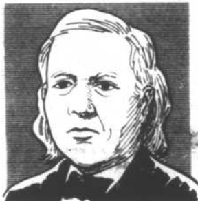
There never was a person who did anything worth doing that did not receive more than he gave.