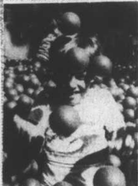
HAVING A BALL...Youngsters really have a ball taking a plunge into a pool of thousands of hollow plastic balls at Busch Gardens in Williamsburg, Va.