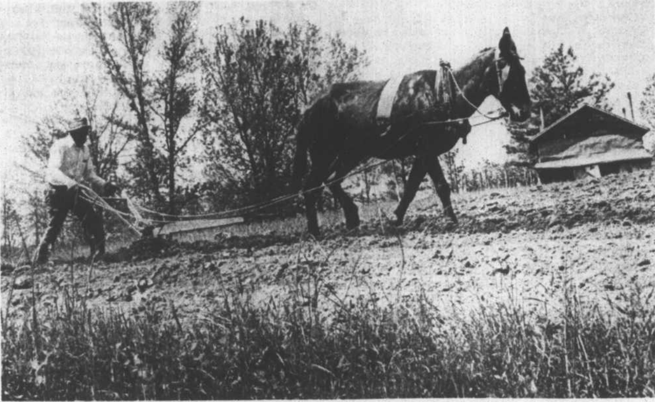
Soil on a Rt. 2, Warrenton farm is broken up in an old fashioned way as this picture illustrates. The use of mules on the spring crops is becoming less and less a