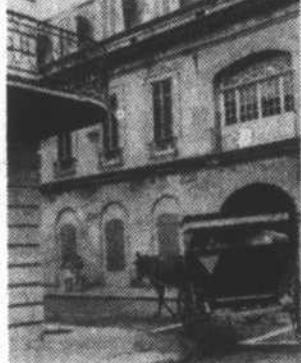
HORSEPOWER ... Horse-drawn carriages, along with the steamboats and the streetcars, make a visit to the New Orleans French Quarter a trip into yesterday.

During the clinic workers will be exposed to new Southern Baptist literature, will learn ways of understanding the learners they teach, and be given practical helps in preparing and leading Sunday School lessons.