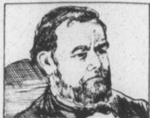
Ulysses S. Grant, an unknown ex-soldier at the beginning of the Civil War, became the first of the nation's generals to wear four stars.

Federated clubs in District 14 are located in Creedmoor, Franklin, Henderson, Jackson, Littleton, Louisburg, Macon, Norlina, Oxford, Roanoke Rapids, Rolesville, Wake Forest, Warrenton and Youngsville.