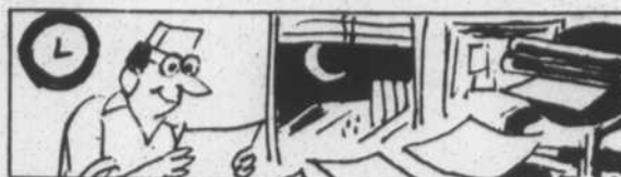
The average daily issue of the Congressional Record carries more than four million words — about equal to 20 novels — yet it's printed and published overnight.

Stubborn cases may require a second dose, but according to an item in the American Family Physician , the hiccup remedy "with a twist" relieved the hiccups in 14 of 16 individuals.