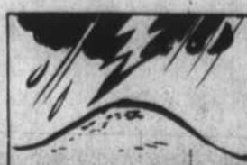
According to folklore, you can expect rain if an ant covers the hole to his death.

He is a 1980 graduate of John Graham High School, Warrenton.