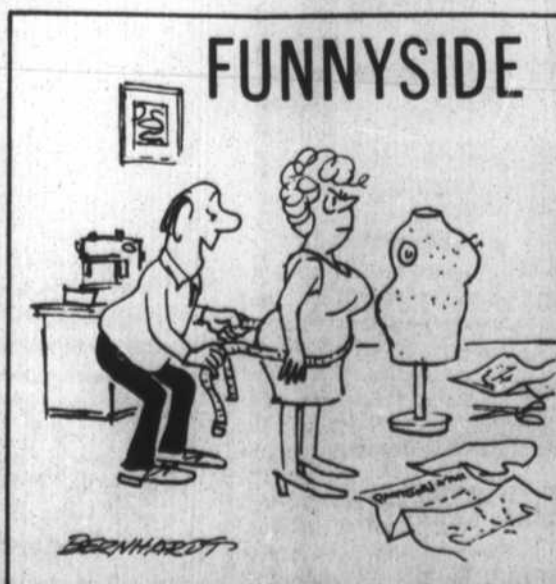
"Want that in inches or just to the nearest foot?"