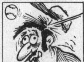
In the early days of baseball, between 1840 and 1850, a fielder put a runner out by hitting him with the ball.

Among the items in the pocketbook was about $58 in cash.