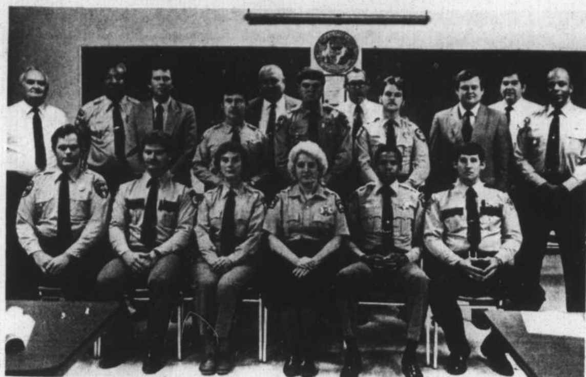
These Are Area Law Enforcement Officers Who Completed Basic Training

tributions they are making "on the front line" of law enforcement.