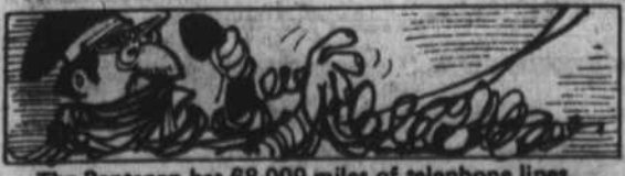
The Pentagon has 68,000 miles of telephone lines.