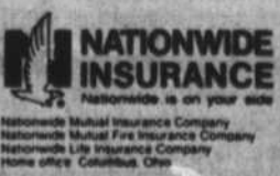
NATIONWIDE INSURANCE NATIONWIDE MUTUAL INSURANCE COMPANY NATIONWIDE MUTUAL FIRE INSURANCE COMPANY NATIONWIDE LIFE INSURANCE COMPANY Home office: Columbus, Ohio