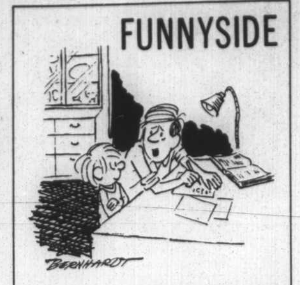
"Of course you must remember, when I was getting "A's" in arithmetic prices were much, much lower."

The camera, like other gamma cameras, uses gamma rays instead of light rays to take its "pictures."