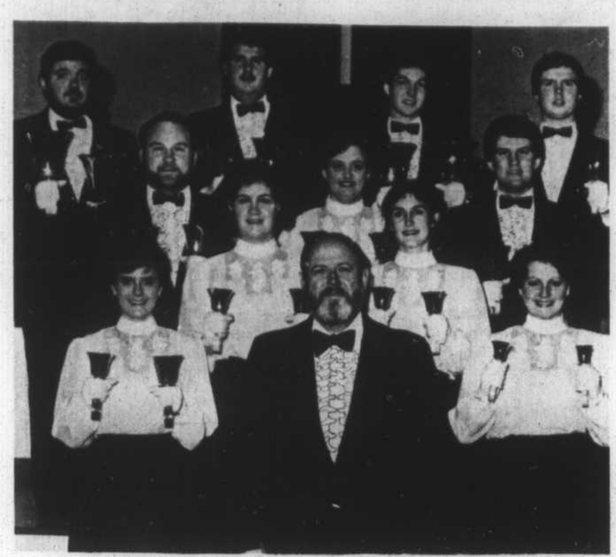
Members Of Pfeiffer Choir To Appear Here