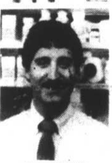
FROM WOODY KING