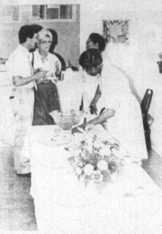
Guests touring the Warren County Senior Citizens Center on Franklin Street in Warrenton during an open house Monday are shown enjoying refreshments courtesy of center volunteers. The open house was held to kick off Senior Citizens Week locally.