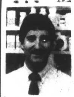
FROM WOODY KING