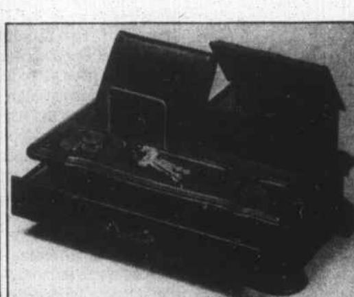
MEN'S DESK TOP VALET OR LADIES