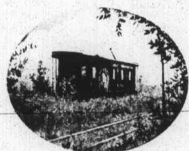
Great Northern Retired