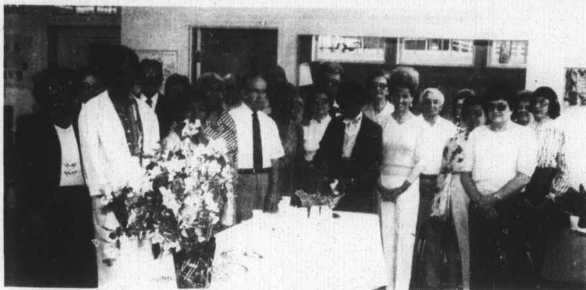
Volunteers with the Warren County Council on Aging were honored last Friday at the Senior Citizens Center on the campus of Hawkins Elementary School for their generous contribution of time and talent in implementing the council's various