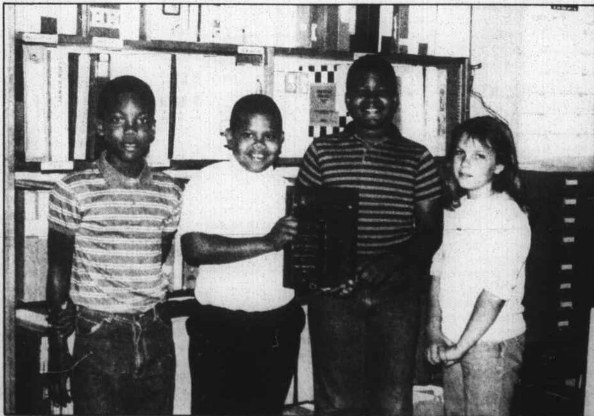
These fifth-graders from Vaughan Elementary School won the recent Social Studies Bowl held among fifth-graders throughout the county. Vaughan students have won four out of six bowls. This year's winners, shown above with their