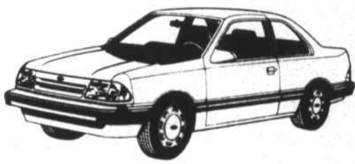
1987 Tempo 2 Or 4 Door