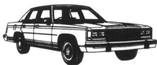
1987 LTD Crown Victoria 4-Door