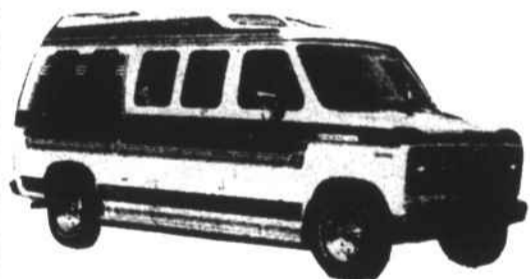
1987 Ford Customized Van