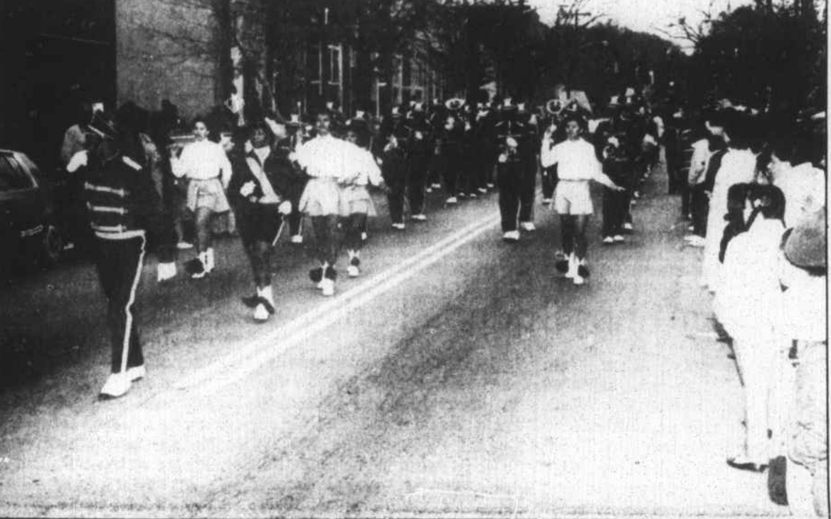
Precision-stepping members of the Warren County High School Band brought musical splendor to