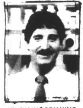
FROM WOODY KING.