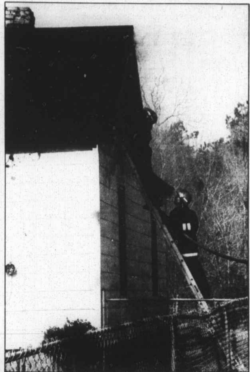
Rich Knisely is followed up the ladder and assisted by Michael Norwood as water is applied to the blaze in the attic area of a frame dwelling at Rt. 2, Warrenton.

drafted from the pool for use in extinguishing the fire. Bystanders are pictured observing in the foreground.