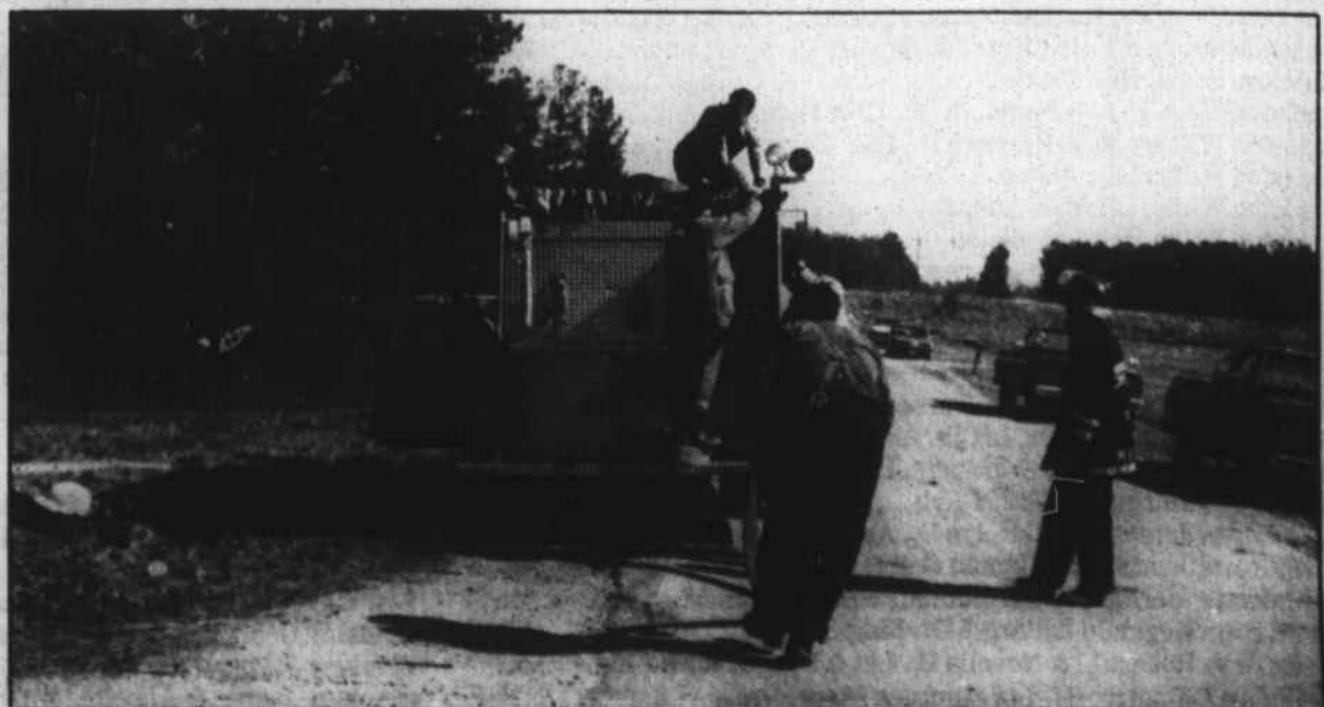
Getting everything in place on this tanker which hauls water from the pumper at the creek to the dump tank at the fire scene are, counterclockwise