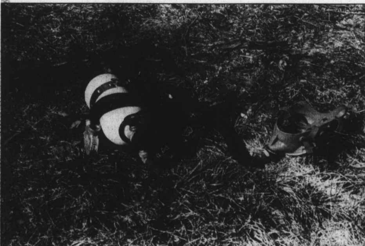
A crucial piece of equipment to the firefighter is this breathing apparatus, valued at $1,000, which

can provide approximately 30 minutes of air to the user. The air tanks can be refilled on the fire scene.