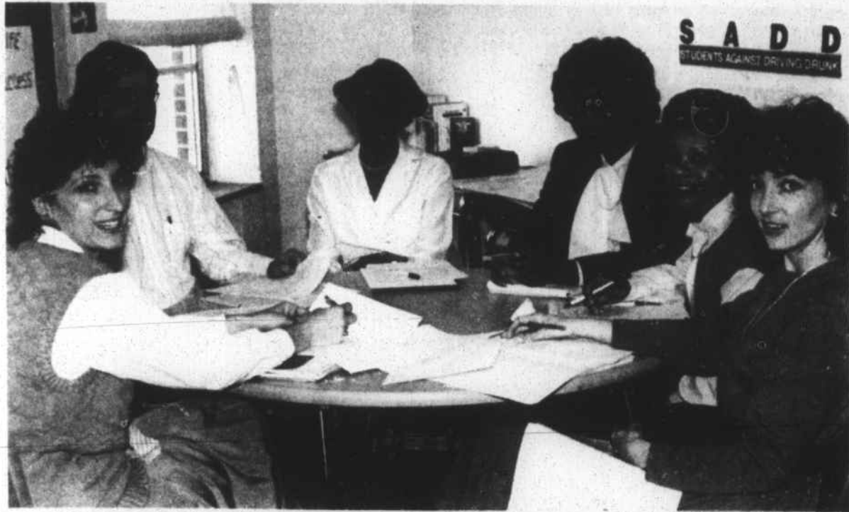
Members of the Warren County Schools' Counseling Team meet to prepare and plan for the 1st Annual Parent Fair scheduled for March 28 from 9 a.m.-12:30 p.m. at Warren County High School. The Parent Fair will offer parents and community members the opportunity to attend nine sessions on a variety of topics of interest, including substance abuse, sexuality, suicide prevention, ad-