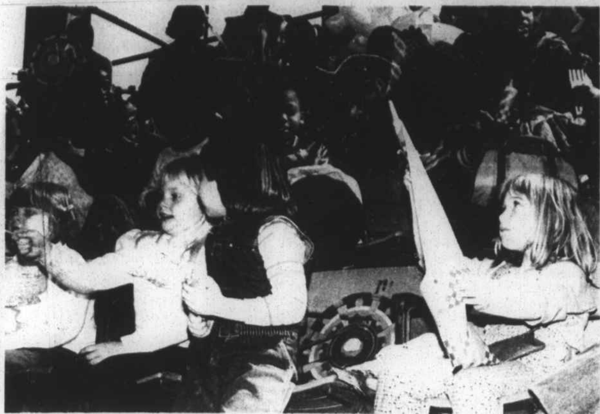
Kindergarten students from Mariam Boyd Elementary School enjoy the "Greatest Show on Earth" during Thursday morning's presentation of Ringling Brothers, Barnum and Bailey Circus at Dorton Arena in Raleigh. Several parent volunteers

After adjournment, refreshments were served by the hostess during the social hour.