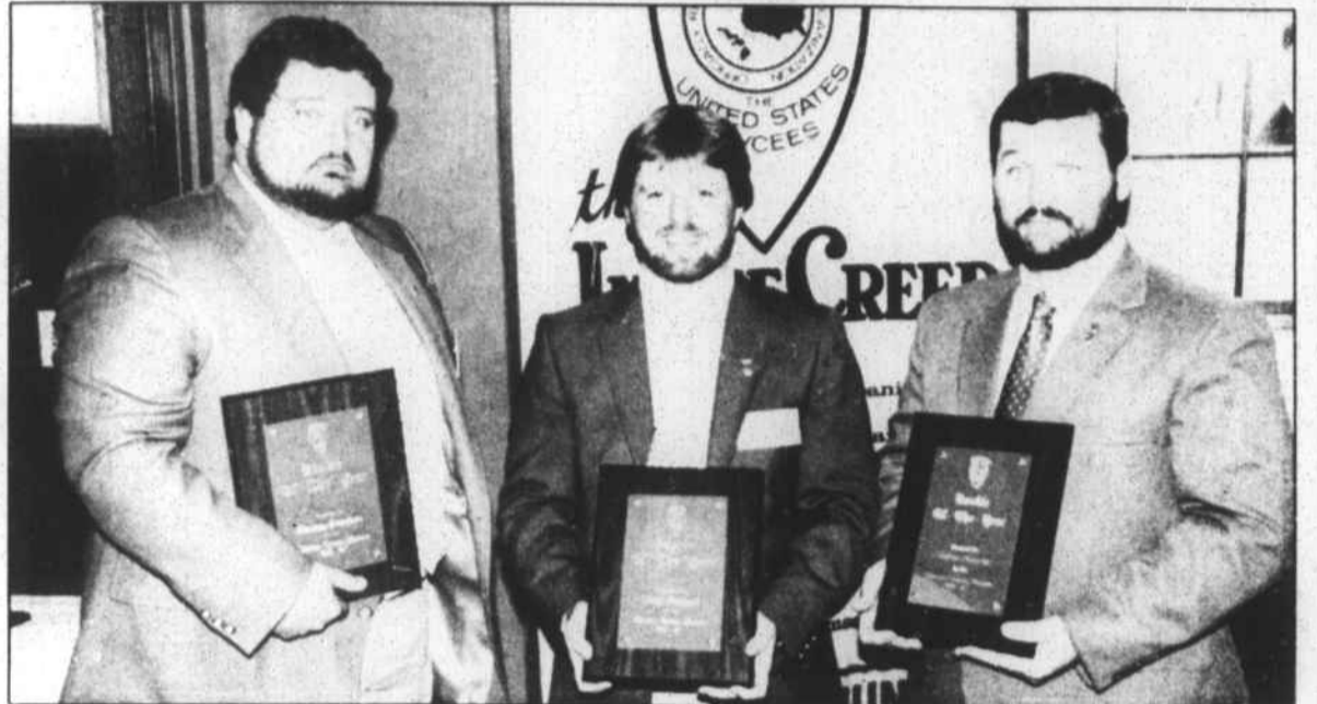
Outstanding member awards were presented to three local Jaycees during a banquet last Thursday at the Warrenton Lions Den. From left are