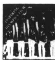
16 DAYS OF GLORY Part II

Every month The Disney Channel is filled with a unique blend of Disney classics plus contemporary prime time series, miniseries, specials, feature films and plenty more. And when the networks are showing reruns, you can be watching homeruns on The Disney Channel.