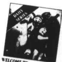
WELCOME TO POOH CORNER

FOR FAMILIES. The Disney Channel helps bring the family together with wholesome, commercial-free programs—where parents and their children can share the warmth, wonder and adventure you'd expect from the name "Disney."