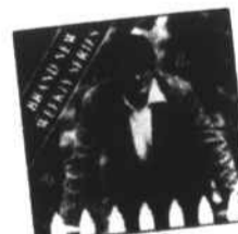
A PRAIRIE HOME COMPANION WITH GARRISON KELLER

FOR KIDS. We know that what kids see on TV today can stay with them forever. So each day, The Disney Channel is carefully planned to educate as well as entertain.