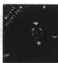
THE FLIGHT OF THE NAVIGATOR