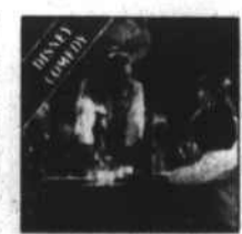
NO DEPOSIT, NO RETURN