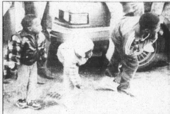
Three of hundreds of Warren County youngsters who crowded into Warrenton on Sunday afternoon strain to catch a glimpse of what's coming down Main Street. To see for yourself what the youngsters saw, see pages 6 and 7.