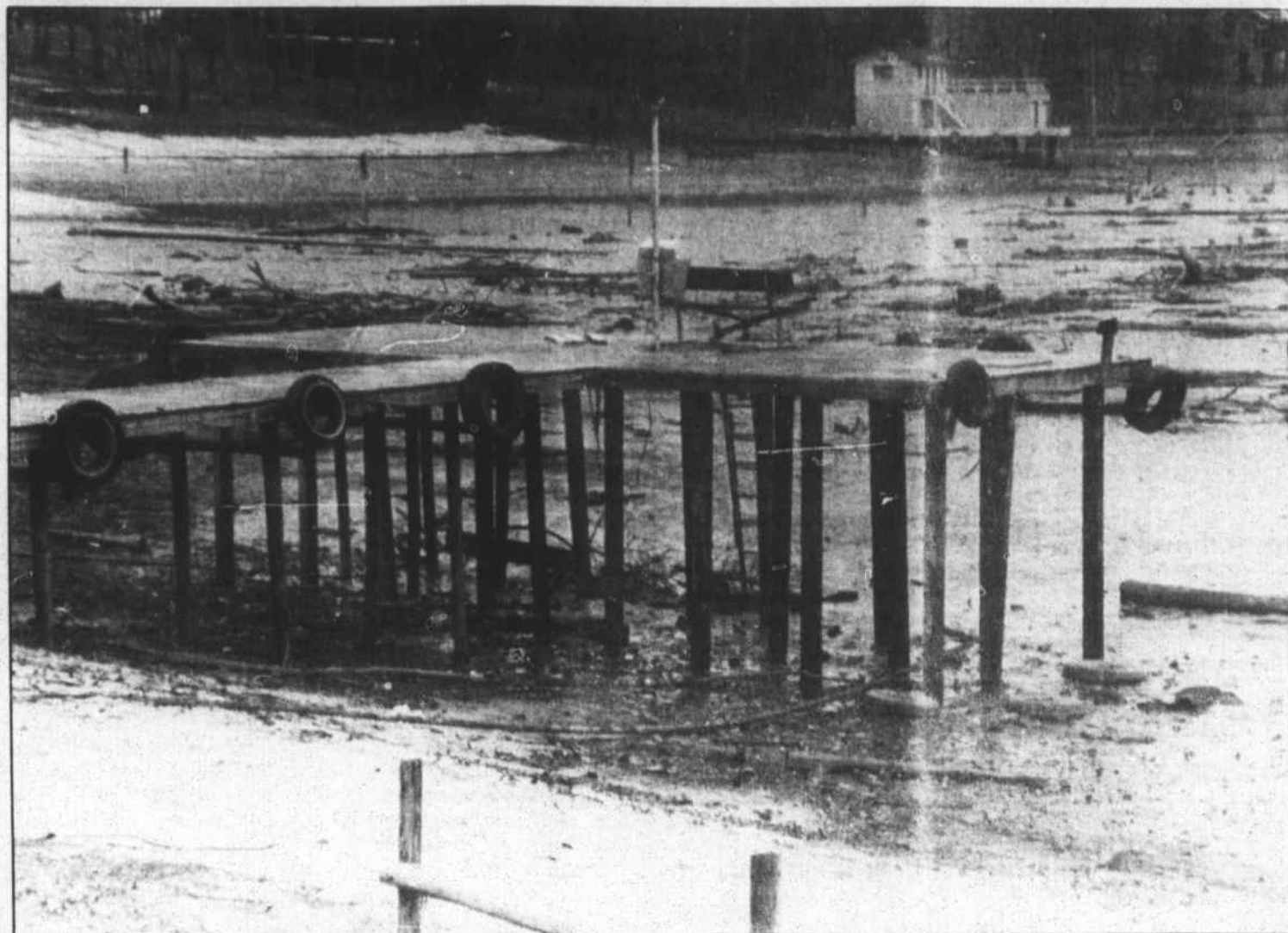
Looking much like the witch's house perched high atop fowl legs of fairy tale fame, this pier sighted at Eaton Ferry Estates stands, pilings exposed, providing clear evidence that the recent attempt to lower the water level at Lake Gaston has been

successful. Vegetation and brush, long submerged under the waters that would normally touch the bottom of the pier, are visible.