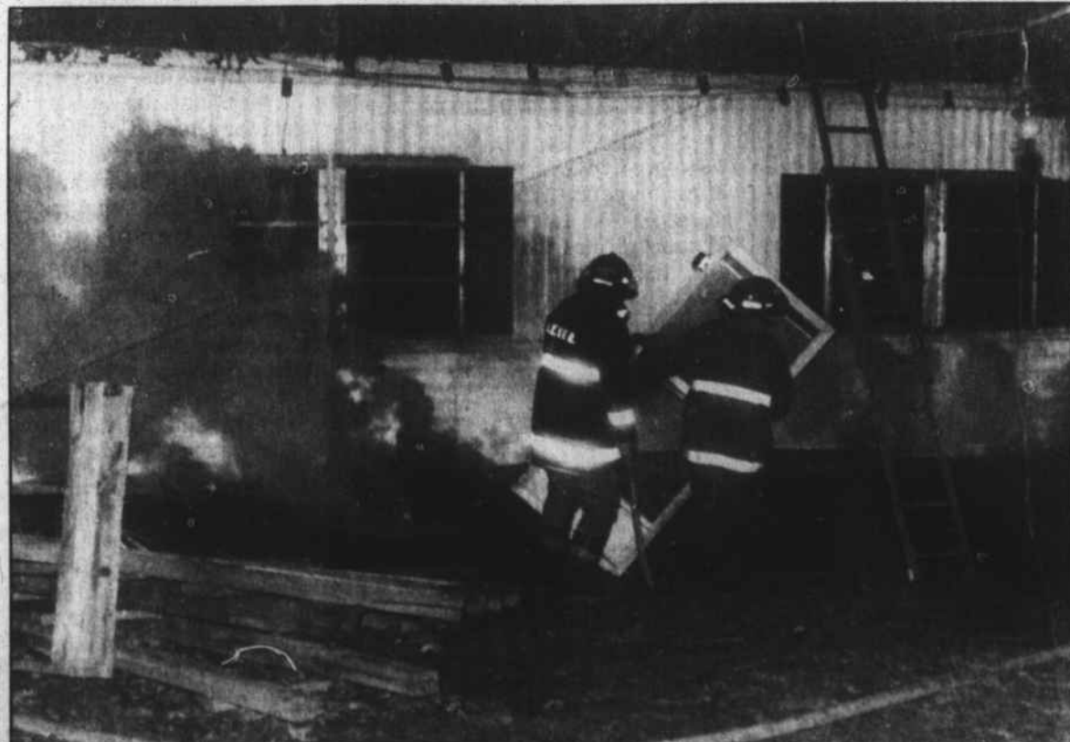
Warrenton Rural firemen are shown battling a blaze Monday night which gutted the mobile home of Raymond Yancey, causing approximately $15,000 in damage. The fire is believed to have

The identity of the two "unmasked men" remains unknown.