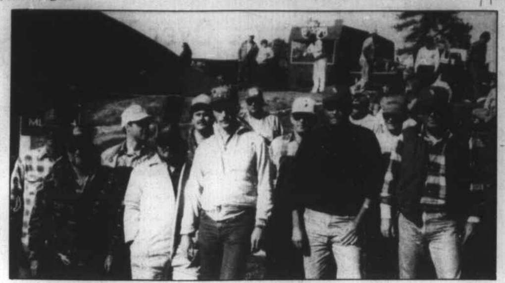
Ten Top Money Winners Shown Following Awards Presentation