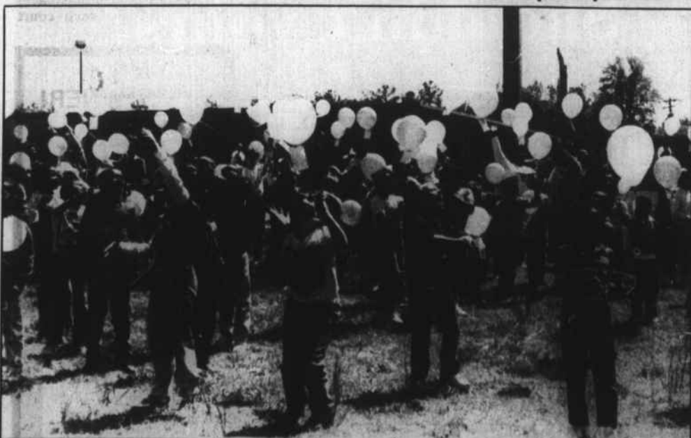
The children and staff at Northside Elementary School recently participated in a balloon launch to help celebrate Media Day at the school. Each balloon had a special message written on it. Attached to each balloon was a card with the partic-

If your favorite pattern is so worn that it's beginning to fall apart, press it onto fusible interfacing. There are several products on the market for this purpose.