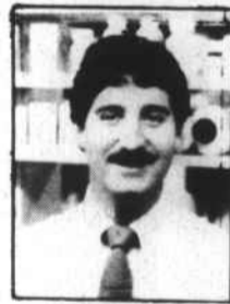
FROM WOODY KING