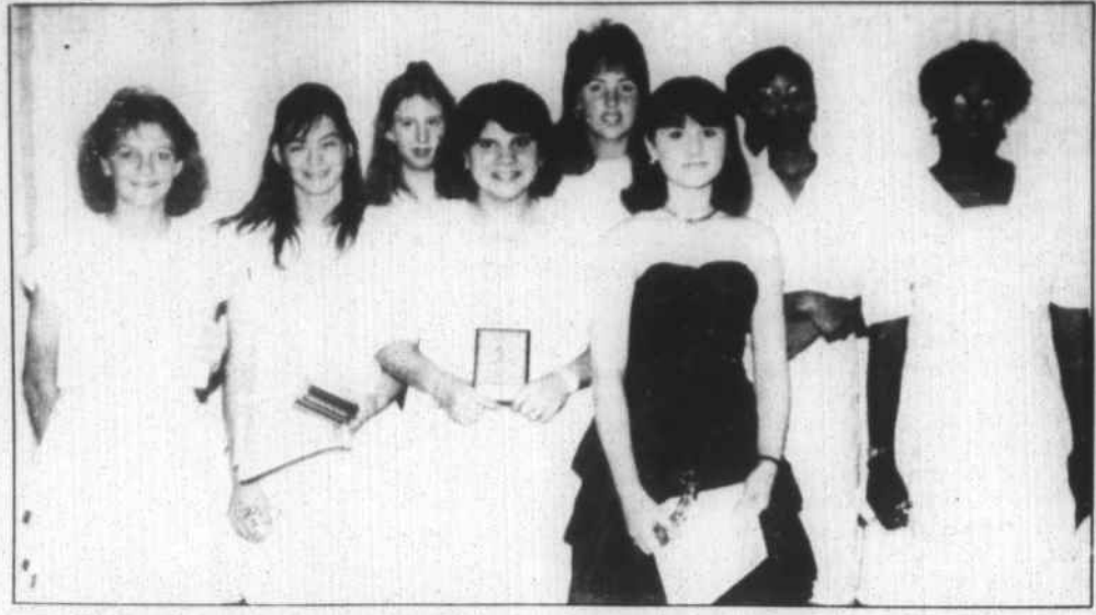
Norlina Middle School's volleyball team members who received special awards at the Athletic Banquet held last week are, from left,