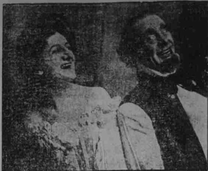
A Pair of Facts That Have Made You Laugh for Three Consecutive Years.