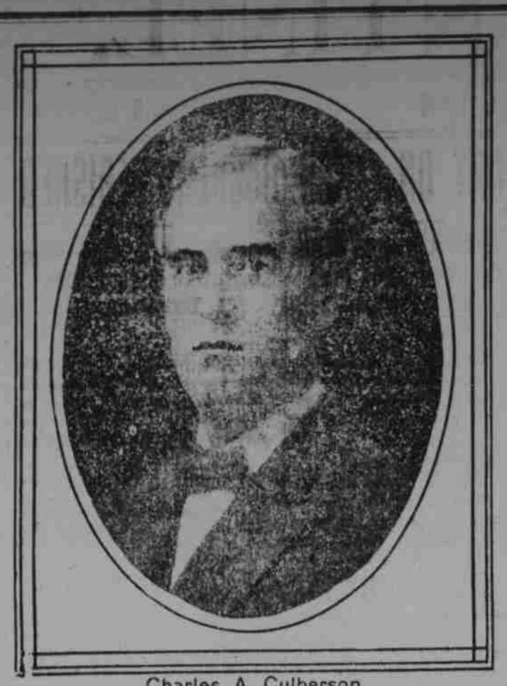
Charles A. Culberson. Senator from Texas