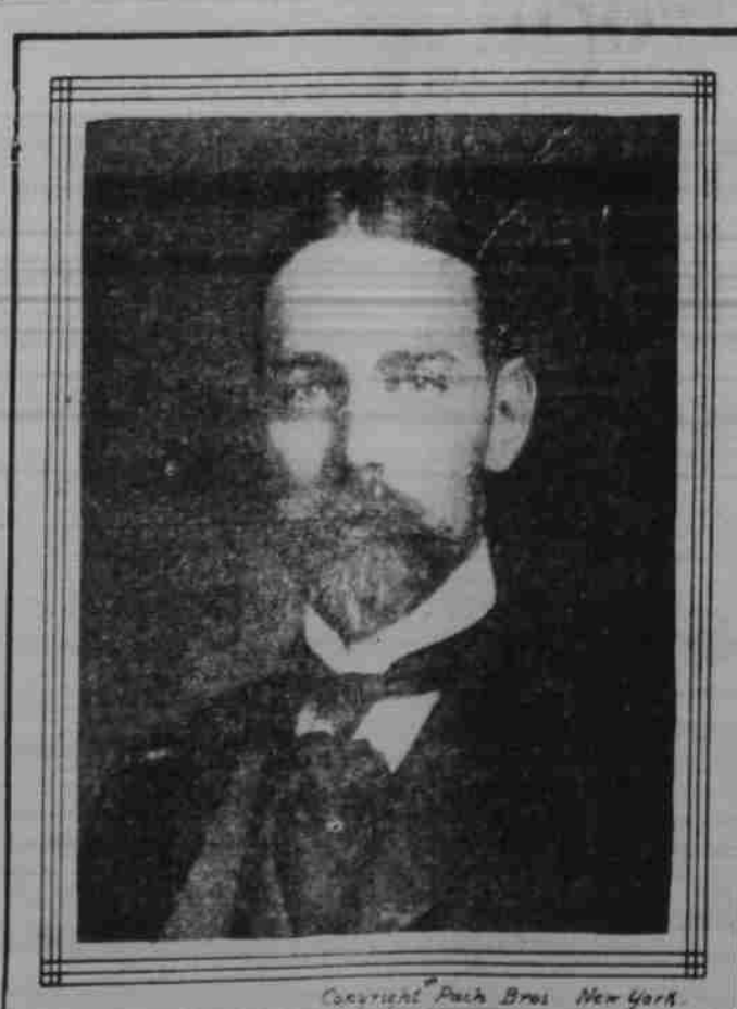
Beekman Winthrop, Governor of Porto Rico.