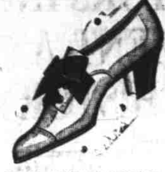
OUR SPRING LINE of the Famous STAR BRAND SHOES