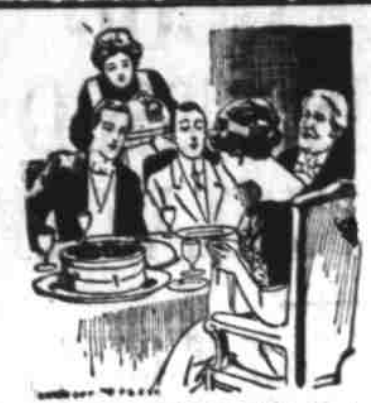
FOR YOUR REPUTATION AS A HOSTESS

get before your guests chinaware that you need not be ashamed of-a dinner set which all may justly praise for its exquisite daintiness and artistic design. That is the kind of ware you can purchase from us, at most reason able prices. We are the largest crockery dealers in town and can serve you best. 25c values in our 10c window. See