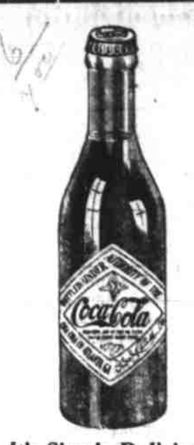
It's Simply Delicious and So Easily Served.