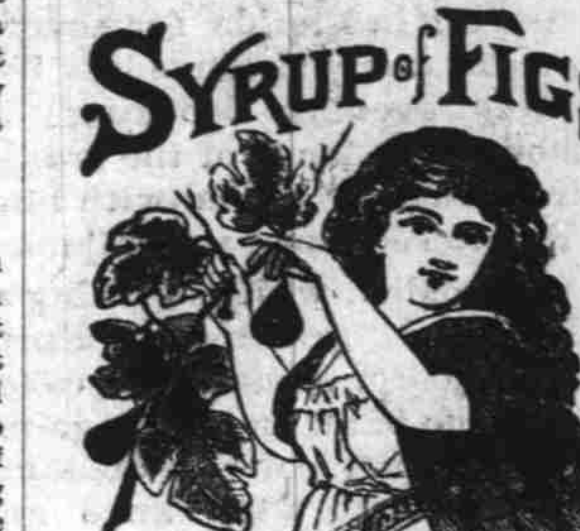
SYRUP OF FIGS

Borax water is excellent for sponging either silk or wool goods that are not soiled enough to need washing. Cashmere or any wool goods may be washed with a little borax in the water and the color not be injured. They should not be rubbed on the board, but only between the hands and hung on the line to dry without wringing. If treated in this way and pressed on the wrong side as soon as dry enough they will look like new.— Washington Star.