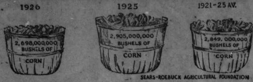
SEARS-ROEBUCK AGRICULTURAL FOUNDATION

HOGS won't have to go on a reducing diet. They will have plenty of corn to eat, in spite of a prospective short crop, which will amount to about 2,698,000,000 bushels this year, according to the Sears-Roebuck Agricultural Foundation. Last year the crop was 2,905,000,000 bushels, considerably larger than the five-year average crop of 2,849,000,000 bushels. This year's crop was grown on 101,074,000 acres and is rated to yield 26.7 bushels per acre. More than 80 per cent of the corn crop is fed to live stock, and hogs consume more than 40 per cent of the crop. This year hogs have been scarce and have not eaten as much from last year's crop as normally. The corn year begins November 1. A year ago the carry-over from 1924 was only 61,000,000 bushels, but because of the shortage of hogs and other live stock the carry-over on November 1 from the 1925 crop will be more than 500,000,000 bushels. This, with the present crop, will be ample to meet all needs, the Foundation estimates, so the hogs and other live stock will not have to go hungry.