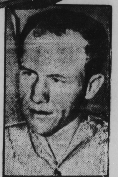
PUBLIC ENEMY CAUGHT—Raymond Hamilton, Public Enemy No. 1 since Baby Face Nelson's death, is shown just after he was captured by Fort Worth, Texas, police without a single shot being fired.