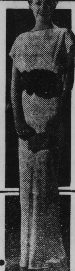
SIMPLE FORMAL FROCK—Charming simplicity is the motif of the formal frock of white embossed crepe worn by Virginia Reid in "Roberta." The bodice is a triangular piece, cut straight across the front neckline and in a deep V in back.