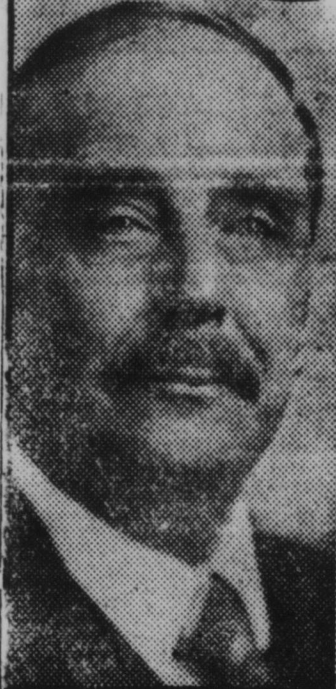
WELLS URGES WORLD STATE—H. G. Wells, British author, comes sharply into the news this month with his article in the American Magazine advocating a "Federal World State" to replace the League of Nations. He maintains that all talk of disarmament without establishing an international police army to enforce it is "rubbish."