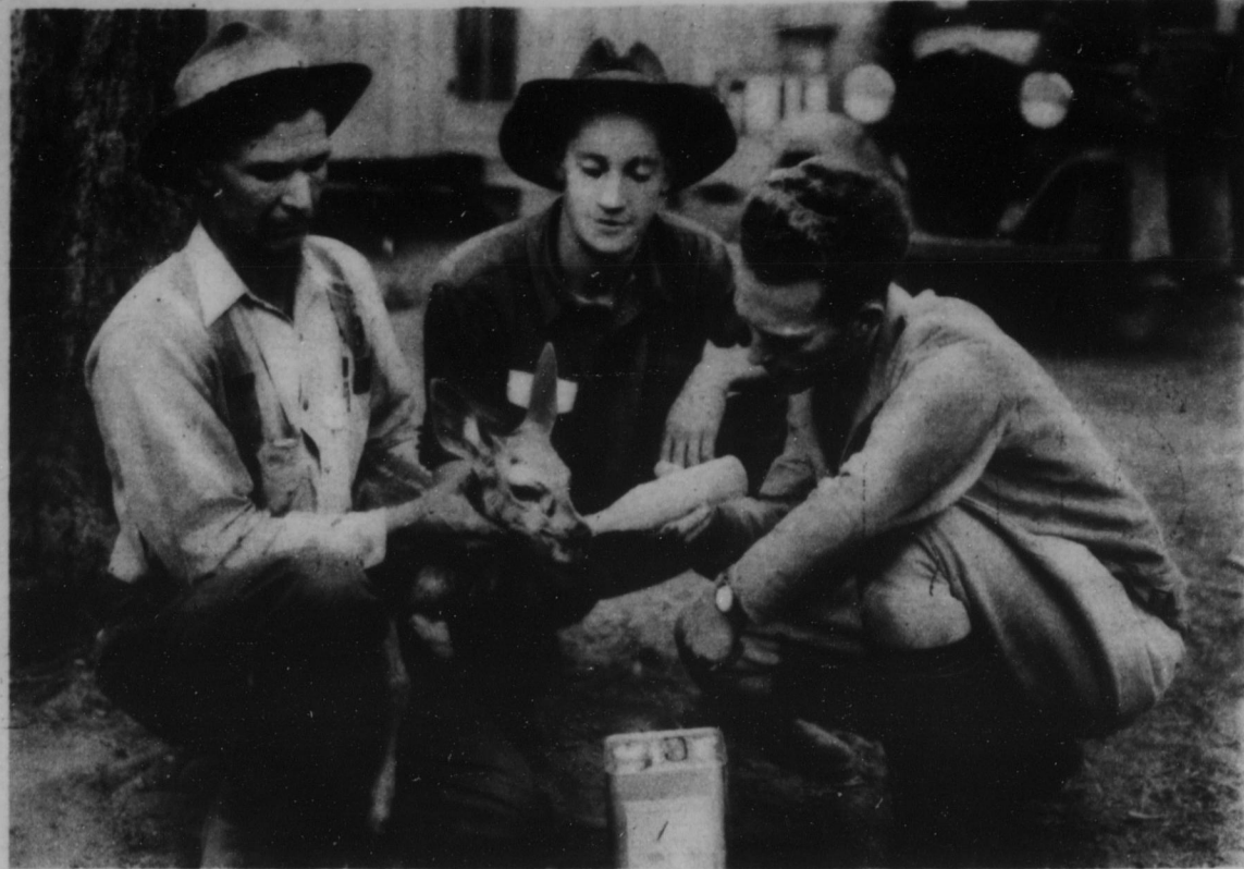
Above: OH DEER! C. C. C. boys doctor and feed a fawn which has been attacked by dogs in between their operations on eroding farm land.