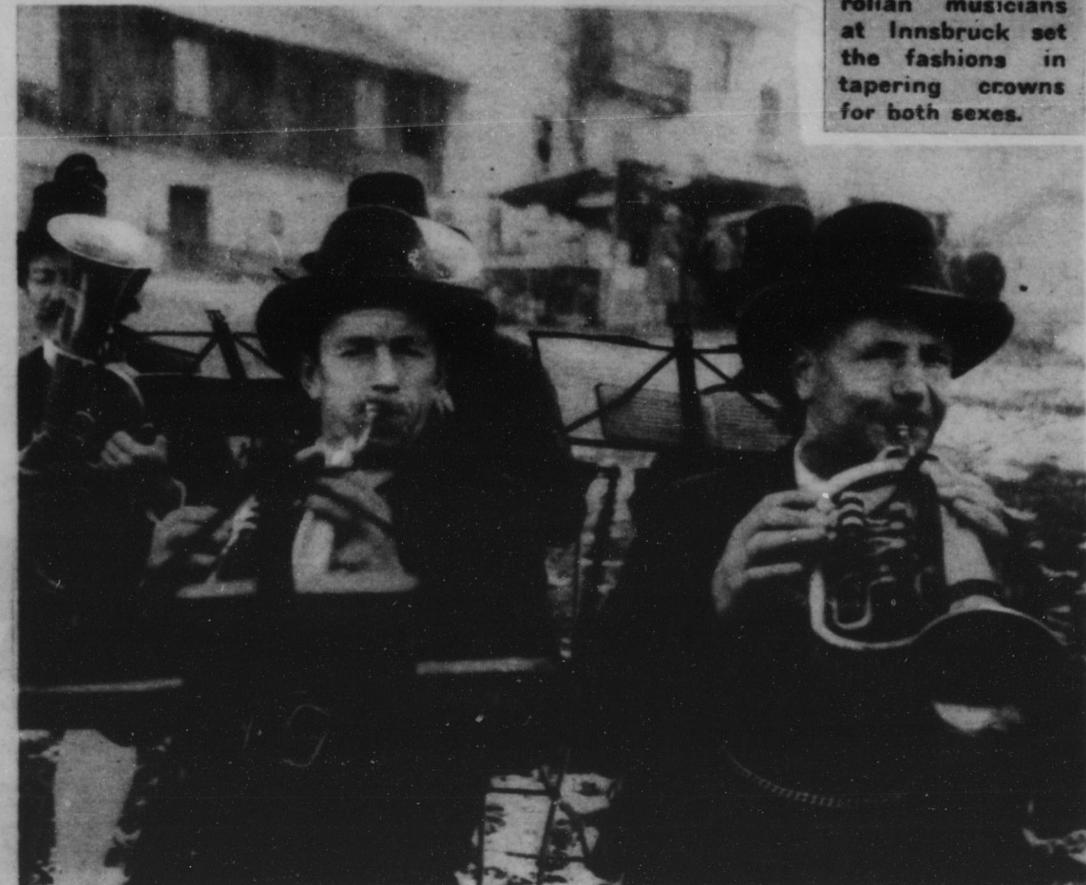
Below: ROUND AND ROUND go music and hats. The sky pieces of the Tyrolian musicians at Innsbruck set the fashions in tapering crowns for both sexes.