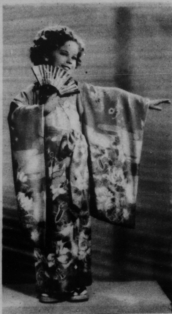
JAPANESE film fans presented Shirley Temple with this handmade silk kimono. So Shirley plays another role.