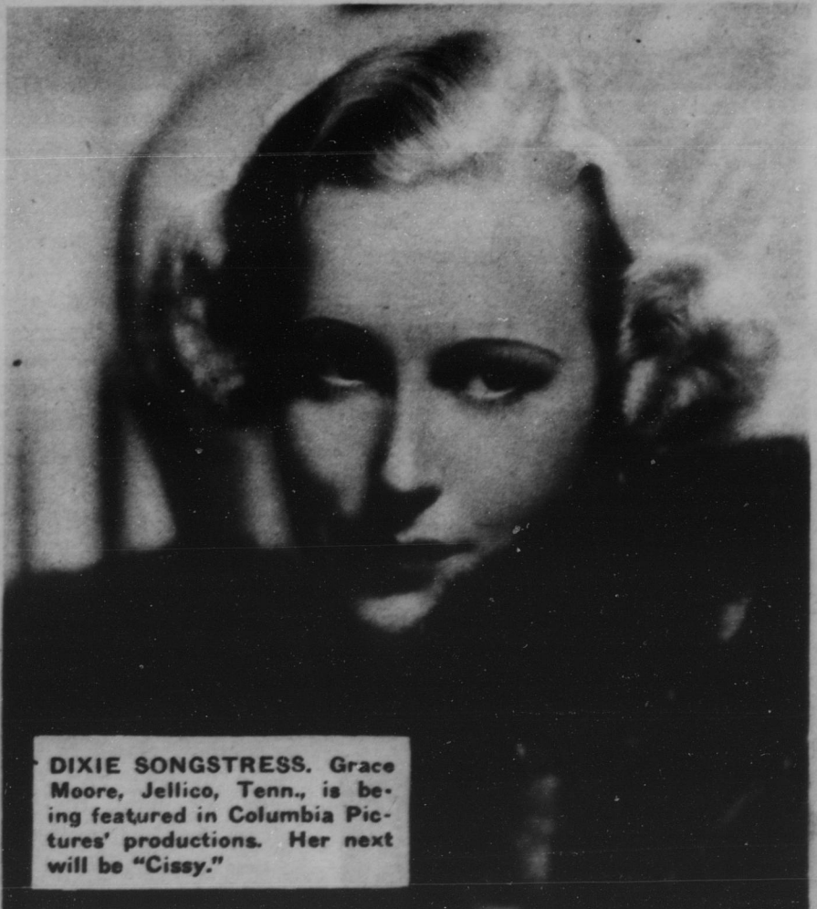
DIXIE SONGSTRESS. Grace Moore, Jellico, Tenn., is being featured in Columbia Pictures' productions. Her next will be "Cissy."