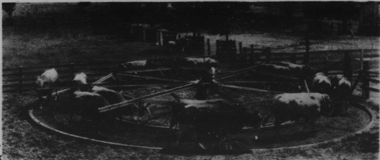
... AND THE BULLS GO 'ROUND and 'round, bel-low! bel-low! And come out here on their exerciser at Belville, Md. Whoa-ho-ho-ho-ho!