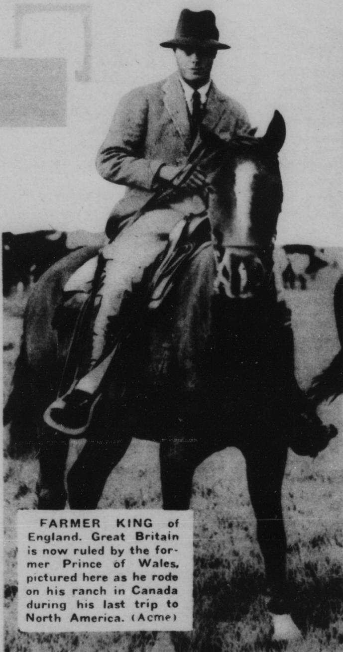
FARMER KING of England. Great Britain is now ruled by the former Prince of Wales, pictured here as he rode on his ranch in Canada during his last trip to North America.