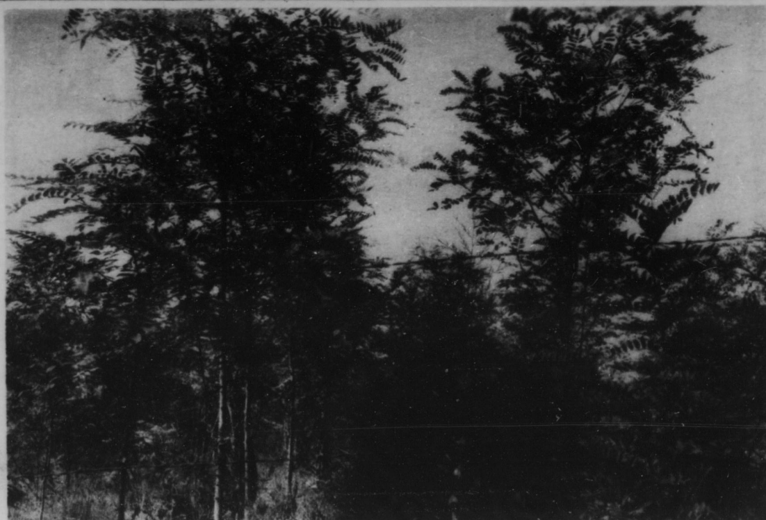
Black locust five years after planting on an eroded Cecil clay hill on the farm of the W. E. Morrison estate, Iredell, N. C.

There farmers years ago cut down the trees on the slopes and uplands. They tried to put every acre into intensive crops—but the slopes and uplands could not continuously bear intensive cultivation. The rain, no longer held back by trees and grass, rushed down from the mountains. It carried the soil away. Millions of acres of sloping uplands be-