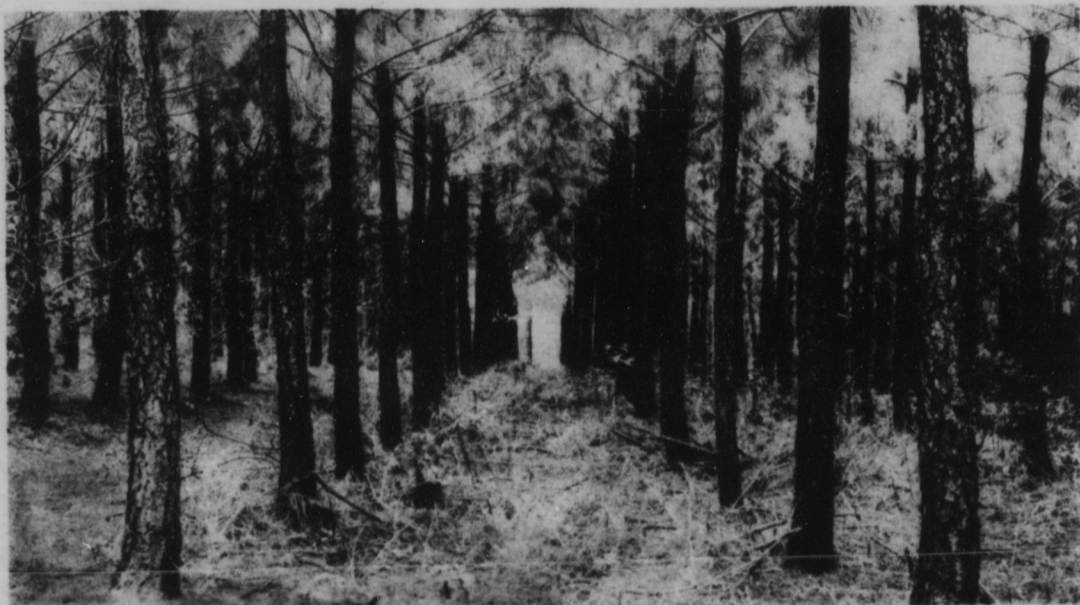
Loblolly pine at Piedmont Experiment Station, Statesville, N. C. One-year seedlings were planted on poor, eroded Cecil clay in February of 1927. This picture was made in August of last year.

"Plant the seedlings," Graeber said, "immediately after they are secured if possible. Otherwise, heel-in, getting the roots well covered and moist. When the package of seedling trees is opened do not expose the roots to sunlight and air. While planting, keep the roots moist in a bucket with thick, creamy mud, made with clay and water. Plant trees at same depth as they grew in the nursery.