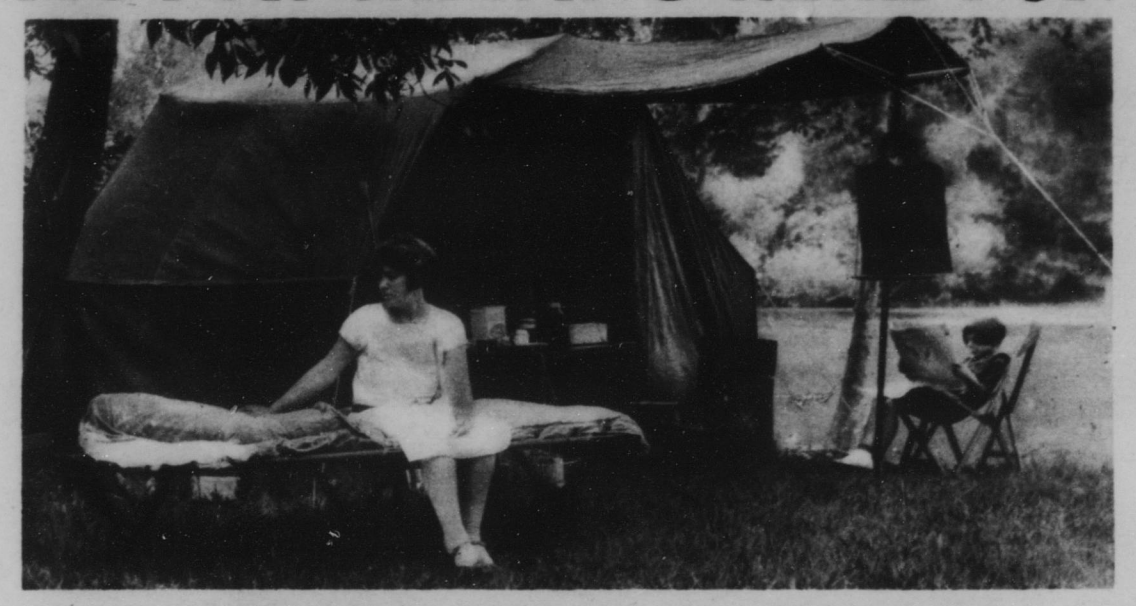
A comfortable tent camp on North Chickamauga Creek, Tenn.