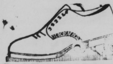
Good Shoes — All Kinds

ANYTHING THE FARMER NEEDS IN READY-TO-WEAR FOR THE WHOLE FAMILY.