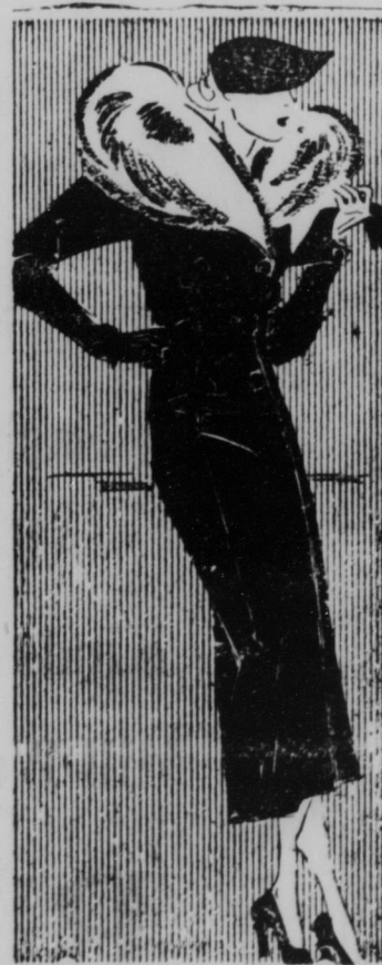
Smart Suits & Coats