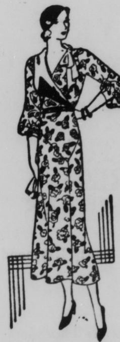
New Fall Dresses