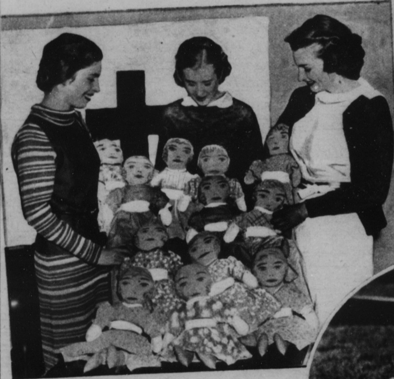
DOLLS BRING HAPPINESS — Junior Red Cross girls whose motto is "I Serve" make hundreds of rag dolls for children who have no toys.