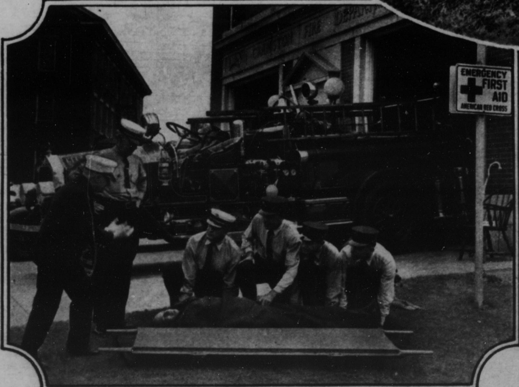
FIGHTING AUTOMOBILE DEATH TOLL —800 Red Cross Emergency First Aid Stations on the nation's highways, soon to be followed by 3,500 more, will reduce fatalities following motor accidents.