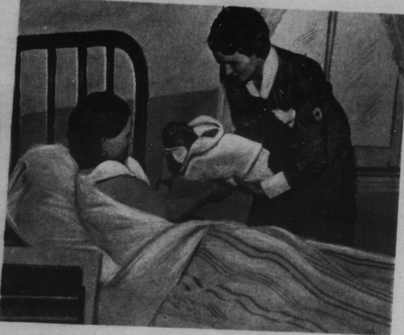
STORK DEFIES FLOODS — The Red Cross nurse helped this baby into the world at height of flood peril in Williamsport, Pennsylvania.