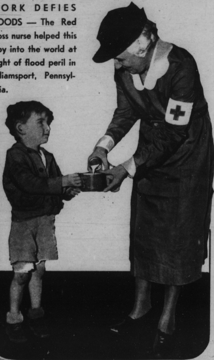
A WISTFUL LITTLE FLOOD REFUGEE —One of thousands of youngsters cared for by Red Cross volunteers in disaster refugee centers.