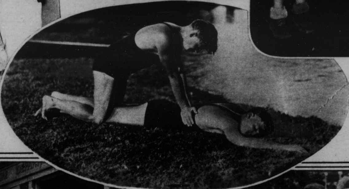
SAVING A LIFE —Red Cross Life Saver demonstrates prone pressure method of resuscitation of drowned person.

145,000 families aided in Spring floods and tornadoes. Relief fund of $7,800,000 given by public for these disaster victims. Help given in 136 other disasters in nation. Red Cross public health nurses made 1,000,000 visits to sick. 212,000 First Aiders and 80,000 Life Savers trained. First Aid and Life Saving taught 75,000 C.C.C. enrollees. 700 First Aid Stations in operation on highways to cut motor accident death toll—3,500 stations being organized. Chapters gave Civilian relief in 800 communities. Home Hygiene and Care of the Sick taught to 50,000 persons. 8,000,000 school boys and girls enrolled in Junior Red Cross. Service to disabled veterans and service men continued. Thousands of volunteers made garments, braille books and gave varied services. These activities carried on in 13,000 communities by Red Cross Chapters and Branches.