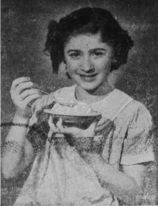
EDITH FELLOWS, COLUMBIA MOTION PICTURE STAR