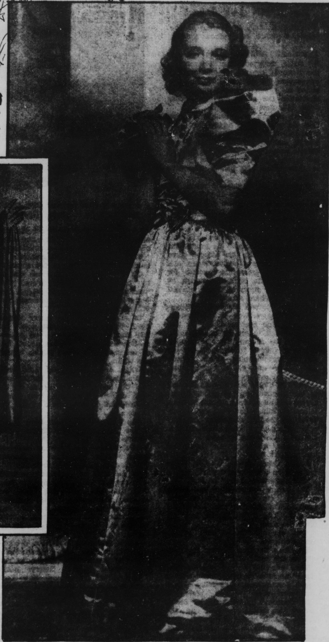
Virginia Bruce shows a picture gown of powder blue slipper satin. Note the full skirt and the fitted bodice and buttons from neck to waist

"A word about boleros: Don't be coaxed into wearing one unless your hips are very slim. A stout woman looks definitely tragic in one.