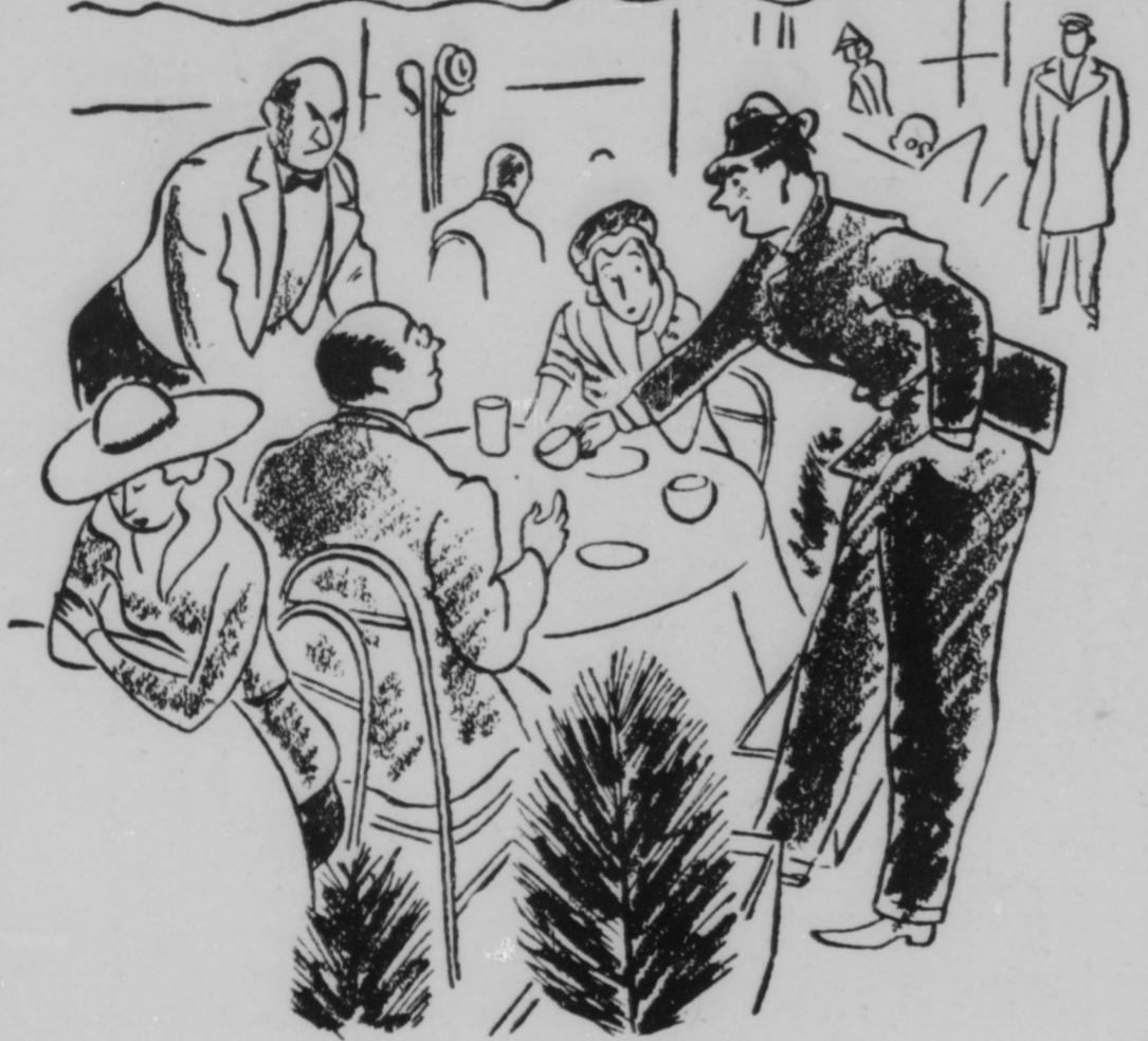
"Spare a cup of coffee, Buddy?"