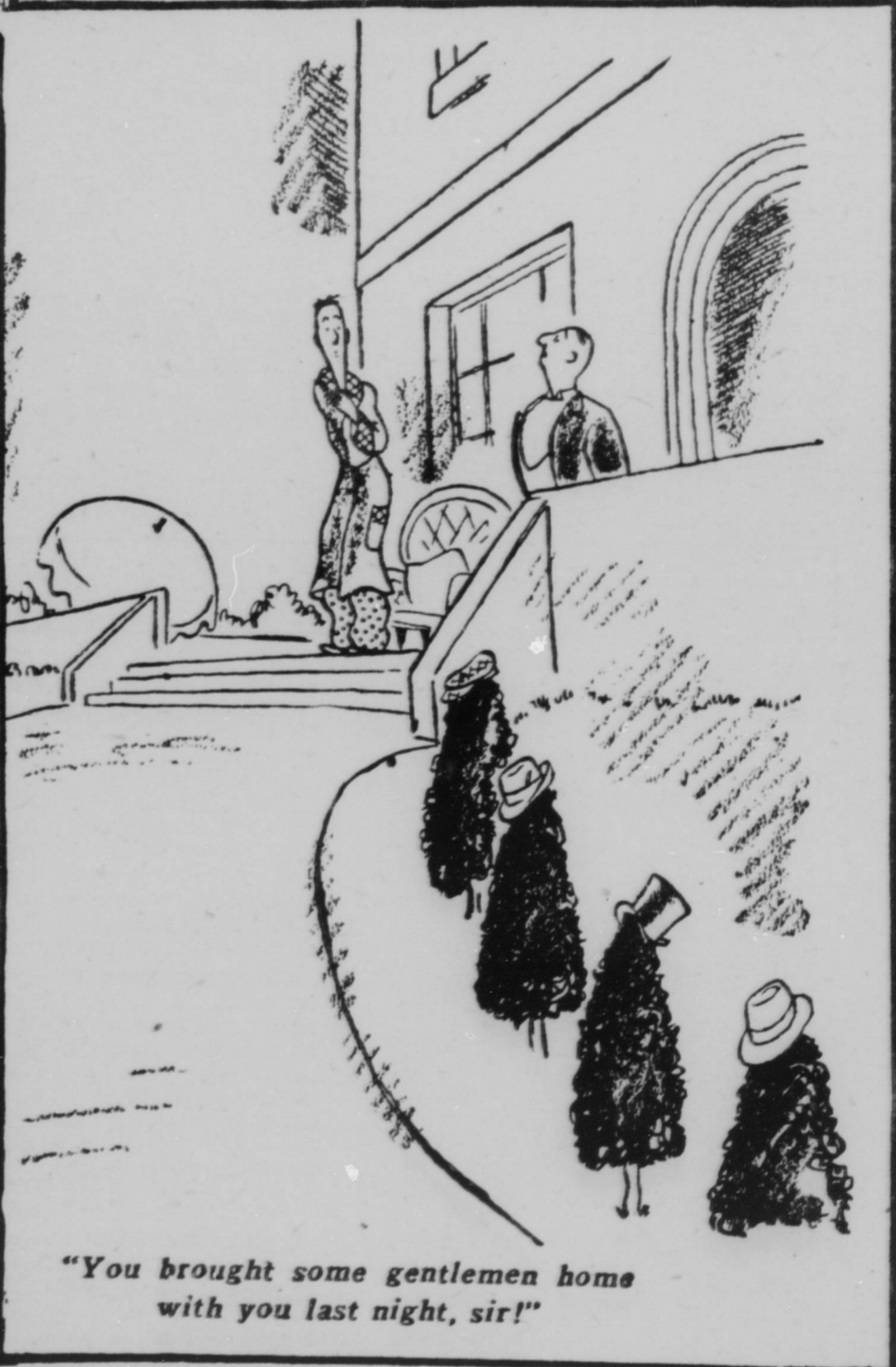
"You brought some gentlemen home with you last night, sir!"