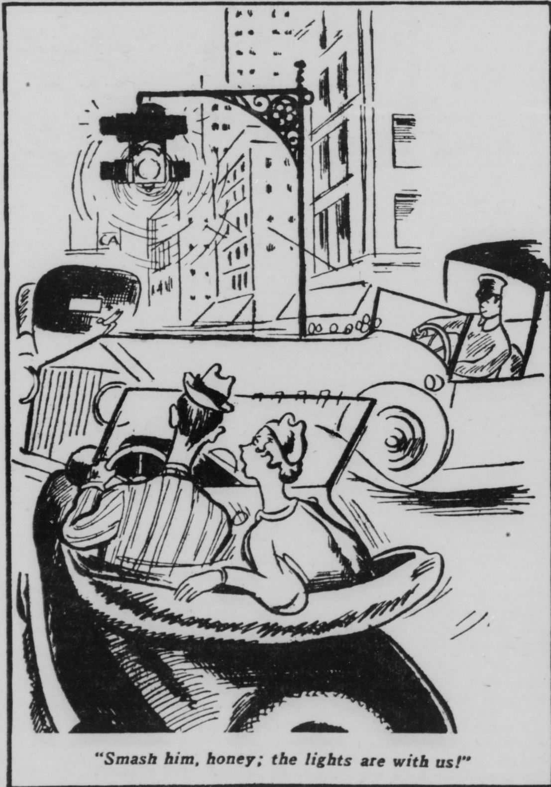
"Smash him, honey; the lights are with us!"