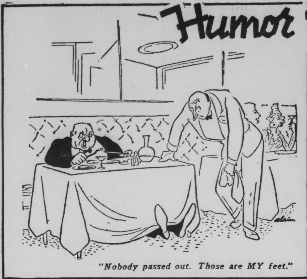
"Nobody passed out. Those are MY feet."