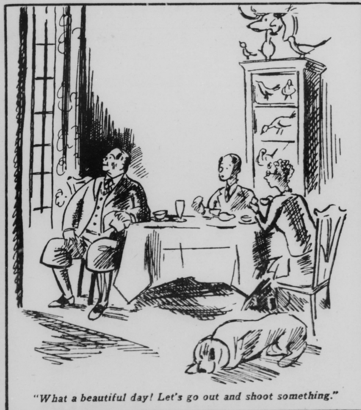
"What a beautiful day! Let's go out and shoot something."