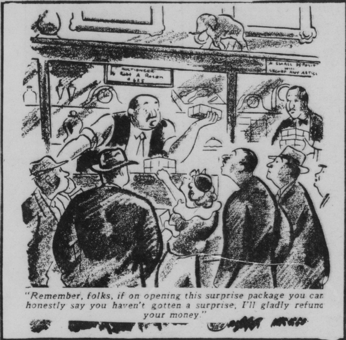
"Remember, folks, if on opening this surprise package you can honestly say you haven't gotten a surprise, I'll gladly refund your money."