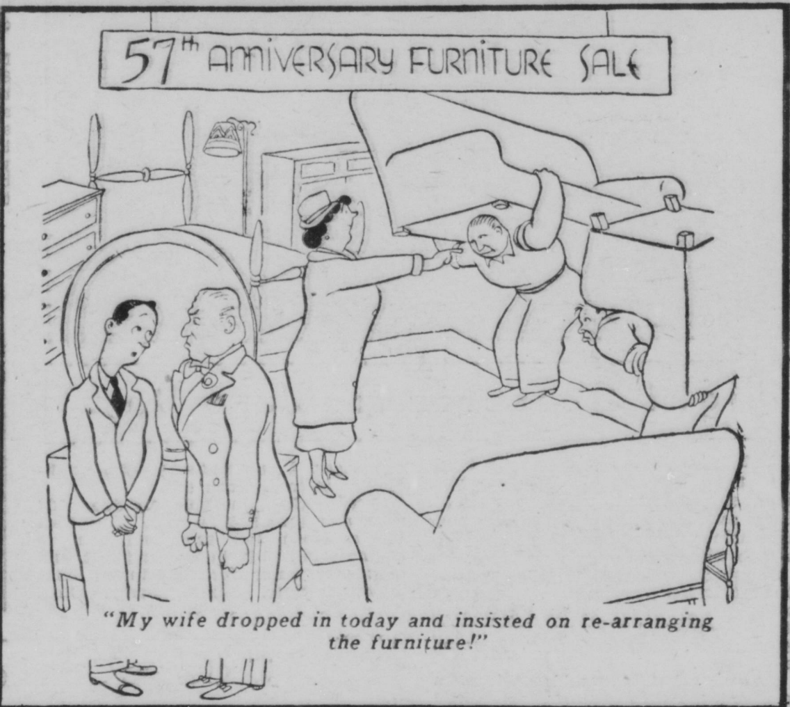
"My wife dropped in today and insisted on re-arranging the furniture!"