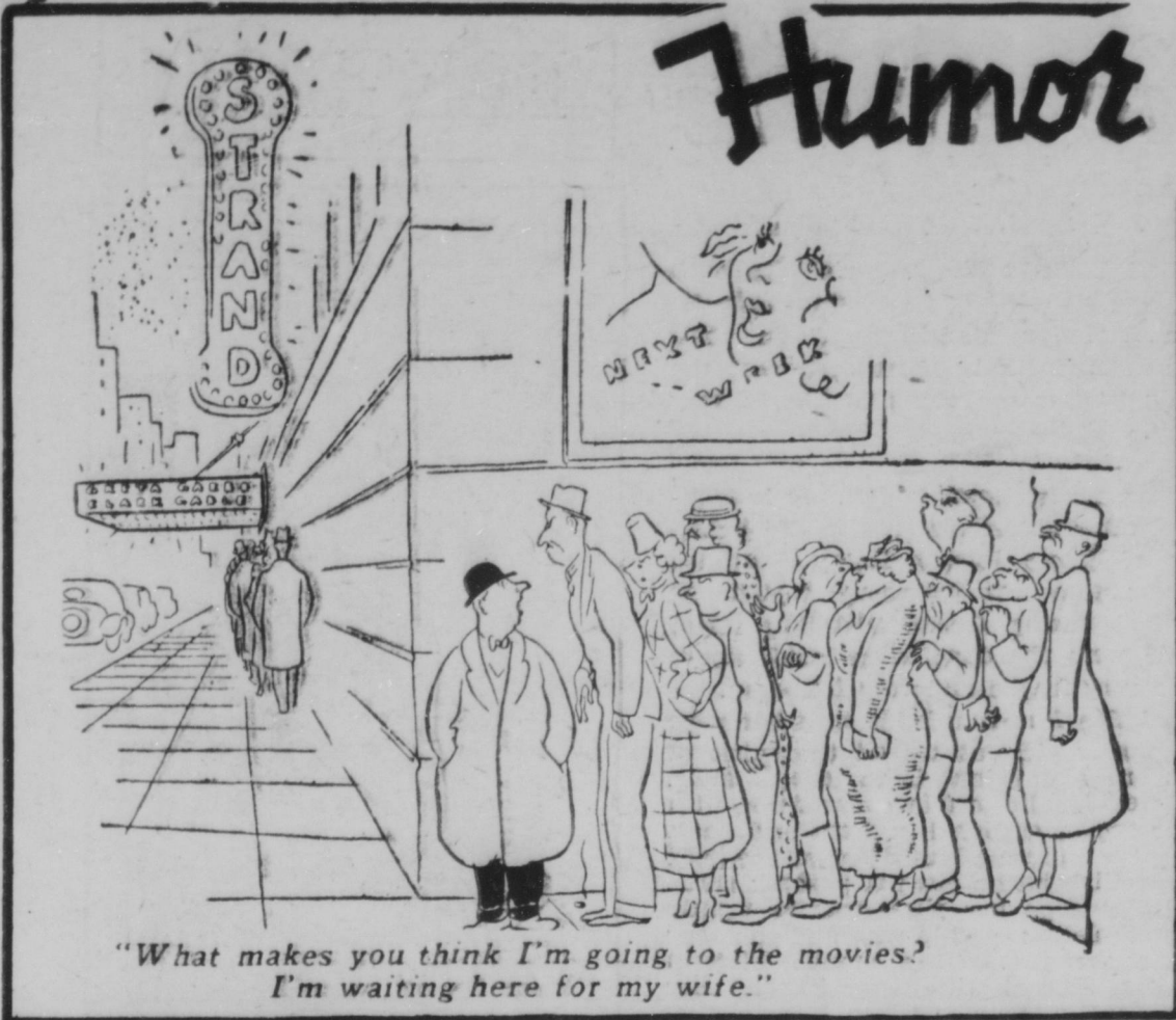
"What makes you think I'm going to the movies? I'm waiting here for my wife."