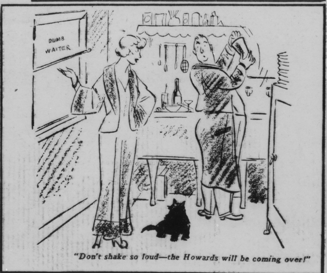
"Don't shake so loud—the Howards will be coming over!"