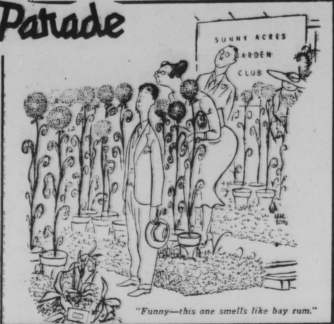
"Funny—this one smells like bay rum."