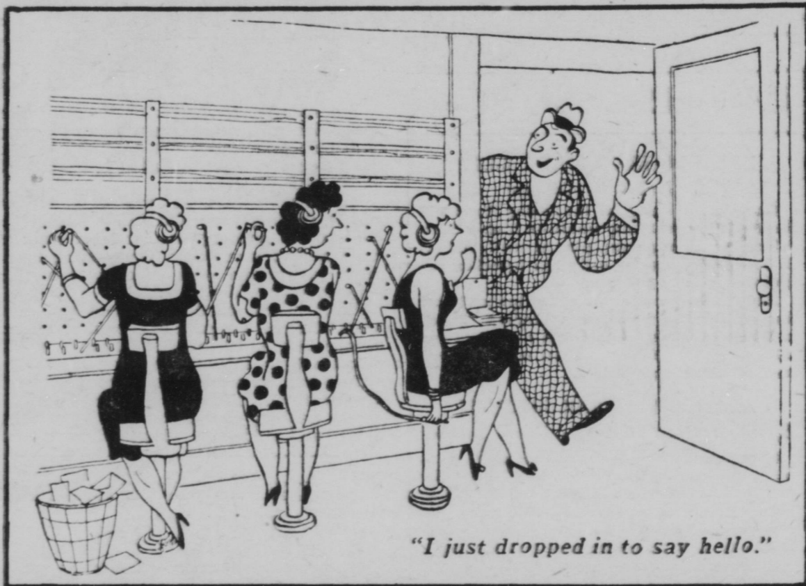
"I just dropped in to say hello."