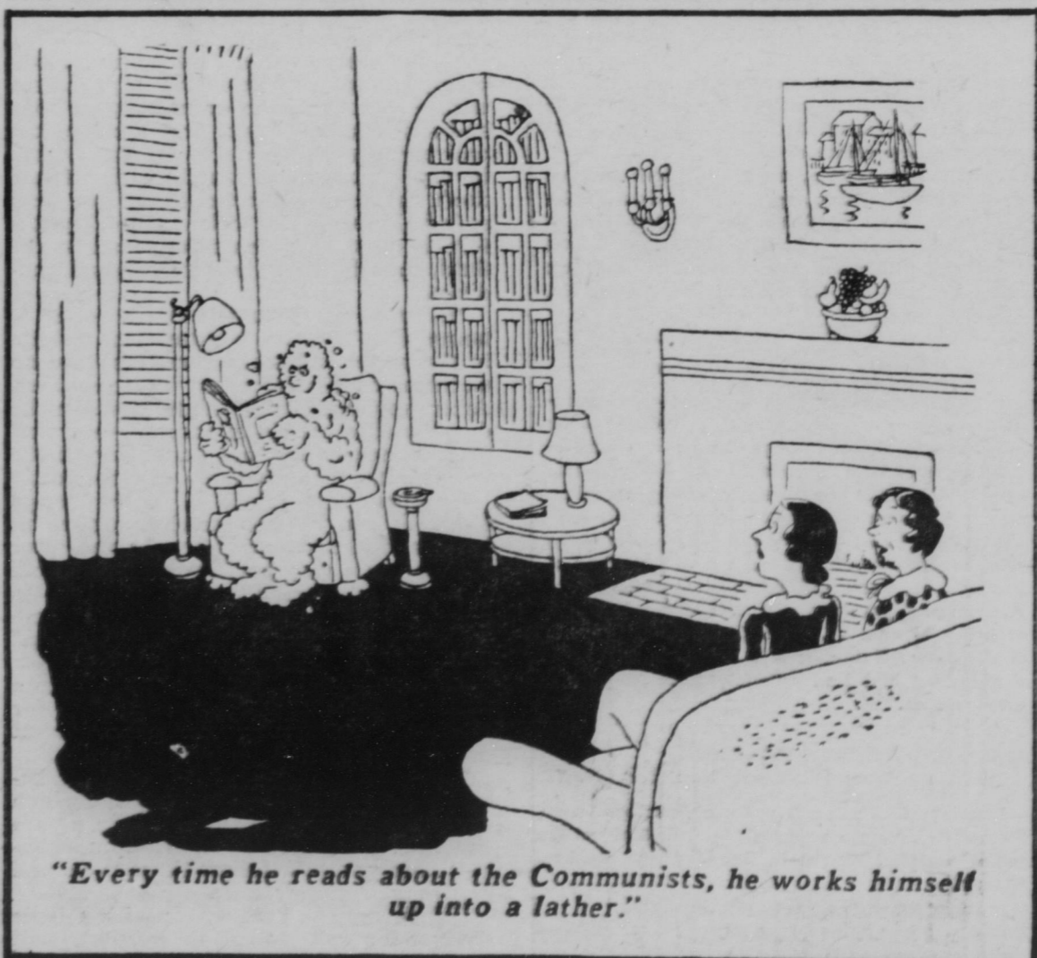
"Every time he reads about the Communists, he works himself up into a lather."